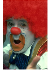
Don't forget the most important element – the children and organise fun activities

Farming Families telling their stories of their life experiences can be a great reality check and people often identify with these.